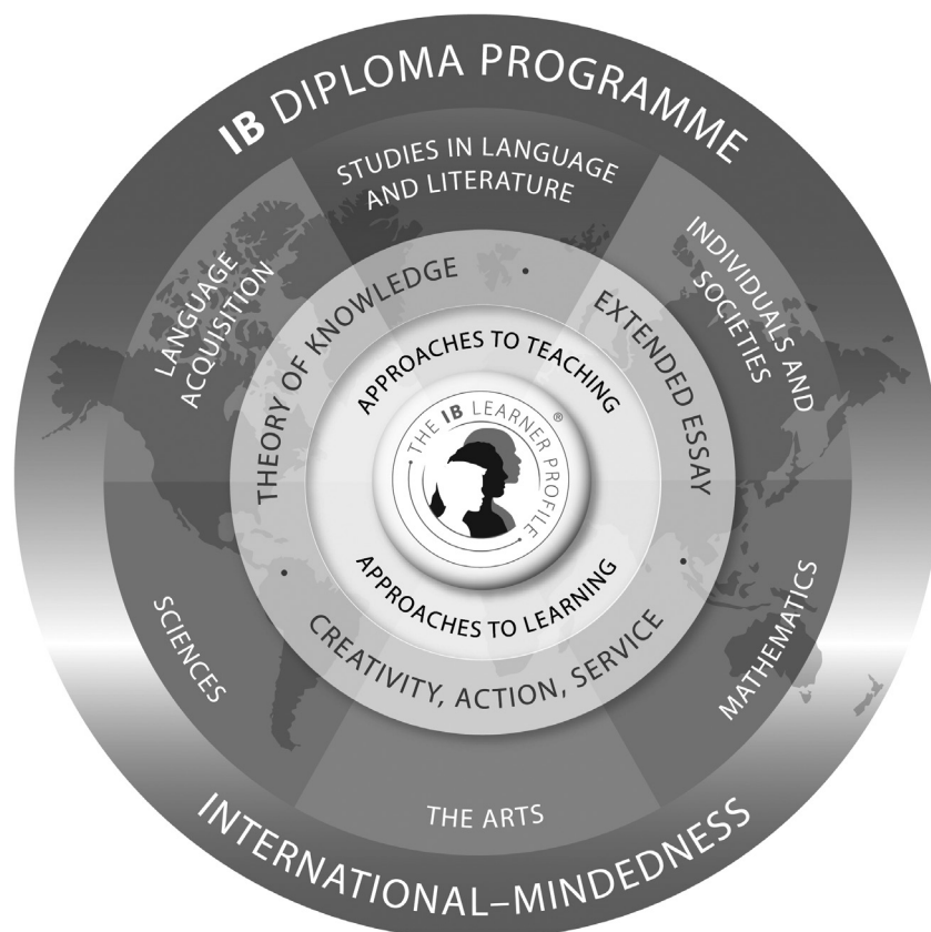
Figure 1 Diploma Programme model

The course is presented as six academic areas enclosing a central core (see figure 1). It encourages the concurrent study of a broad range of academic areas. Students study two modern languages (or a modern language and a classical language), a humanities or social science subject, an experimental science, mathematics and one of the creative arts. It is this comprehensive range of subjects that makes the Diploma Programme a demanding course of study designed to prepare students effectively for university entrance. In each of the academic areas students have flexibility in making their choices, which means they can choose subjects that particularly interest them and that they may wish to study further at university.