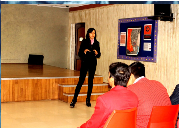
Stills from the event