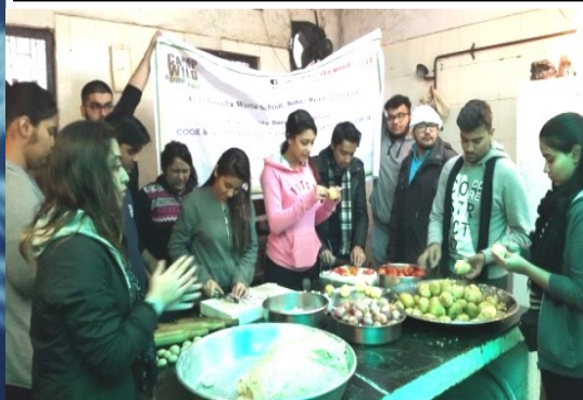
Students cooking together