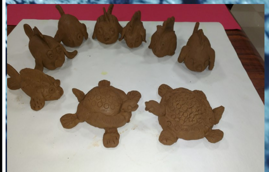
Work of the students