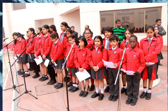
Stills from the Founder's Day