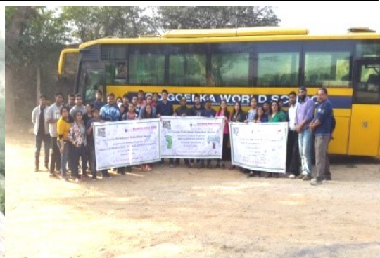
A still from the trip's last day