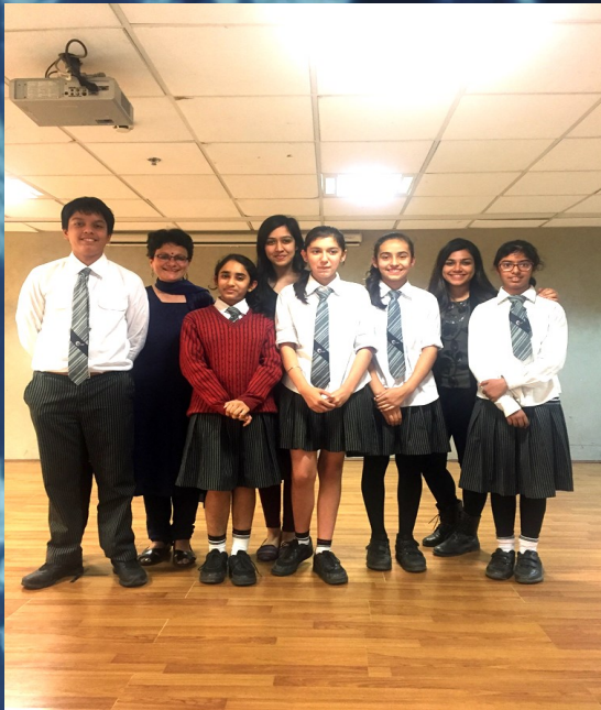
Winners of the competition with their teachers