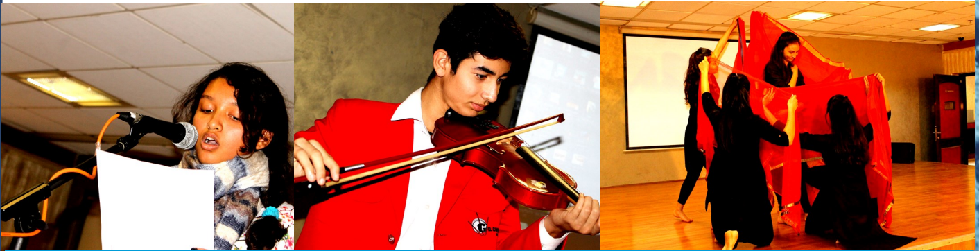
Stills from the assembly