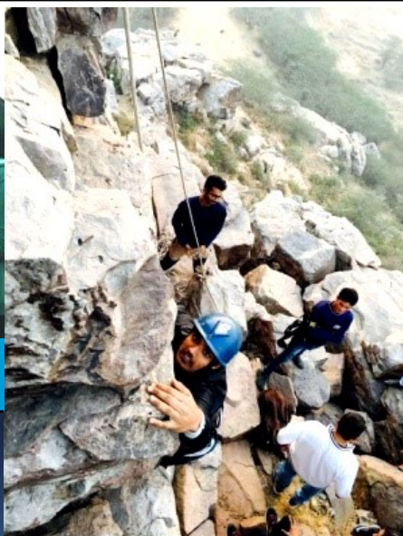
Students during the rock-climbing activity