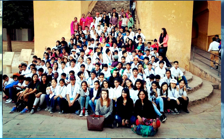
Stills from the trip