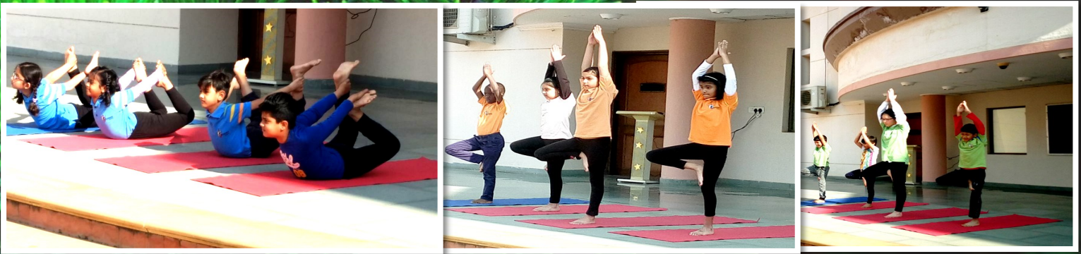
Stills from the event