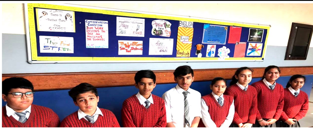
Participants with their work