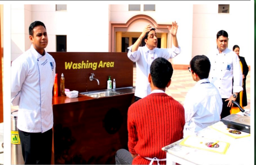
Stills from the event