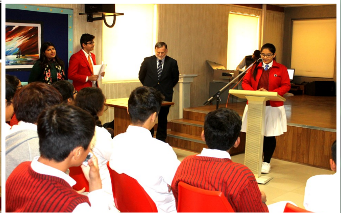
Other stills from the event