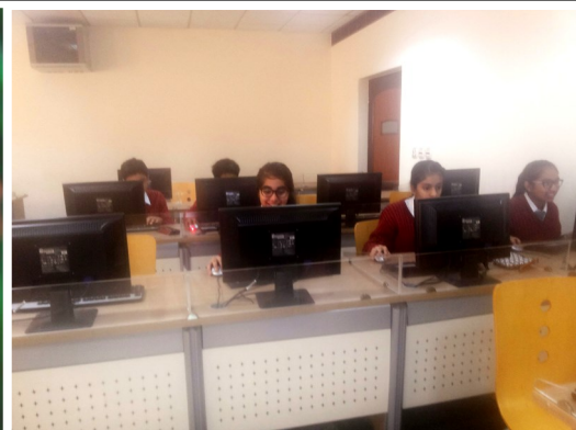
Stills from the event