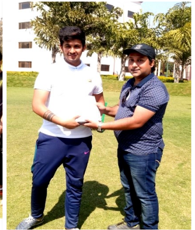
Stills from the event