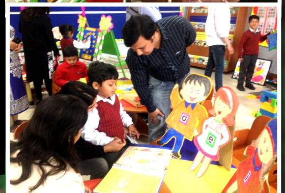
Stills from the event