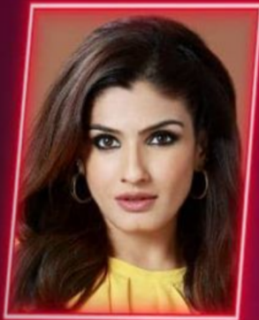
Raveena Tandon Actress