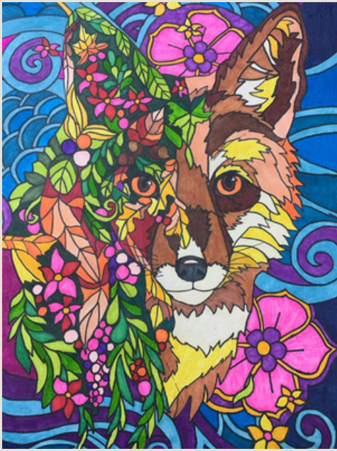
Mansi- Grade 8