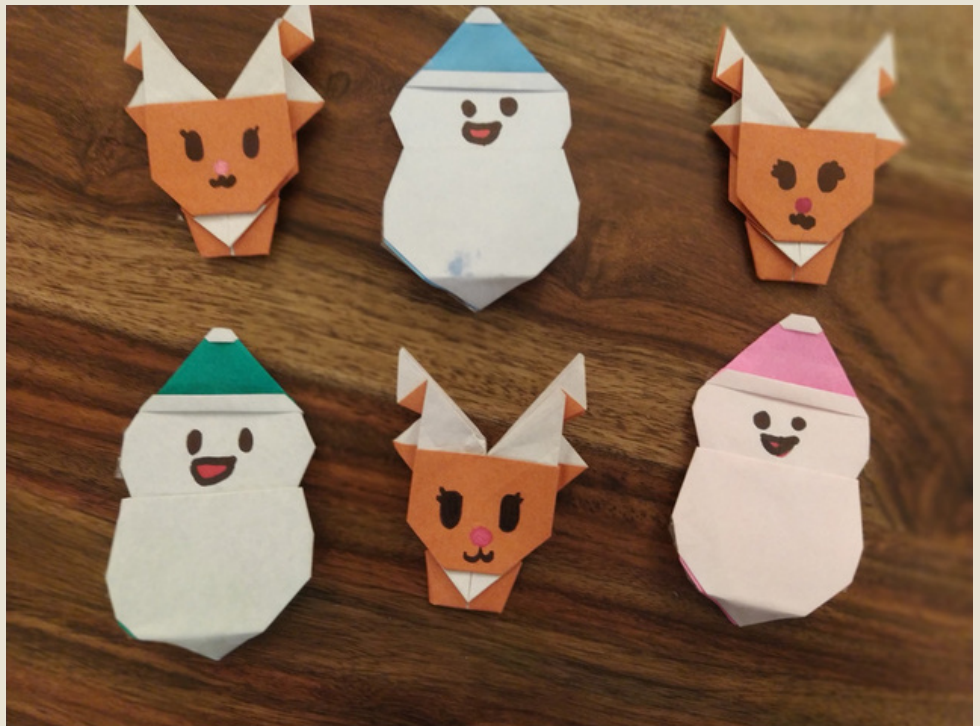
Origami by Nayuta 7A