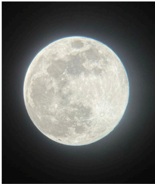
BY ARPITA TIWARI (12TH C)